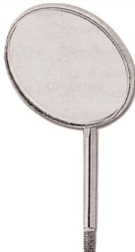
Mouth Mirror #3 No. Cat. 1201