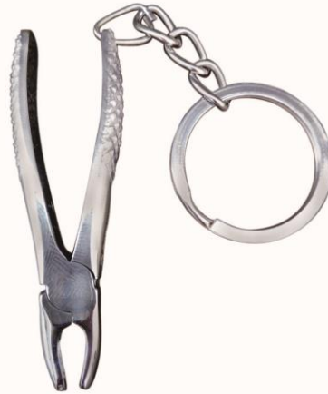
Dental Keyring (Exacting Forcep) S/S Satin No. Cat. 8403