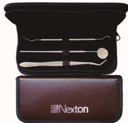
First Examination Kit Pouch Packed No. Cat. 8503