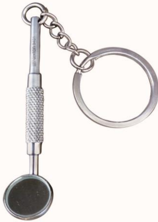
Dental Keyring (Mirror Handle) S/S Satin No. Cat. 8401