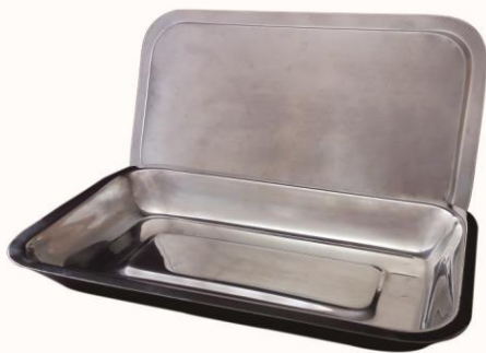
Instrument Tray with Lid S/S Polished No. Cat. 8209