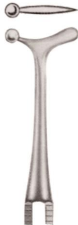
Bugnishers (White) Fig 32 No. Cat. 4235