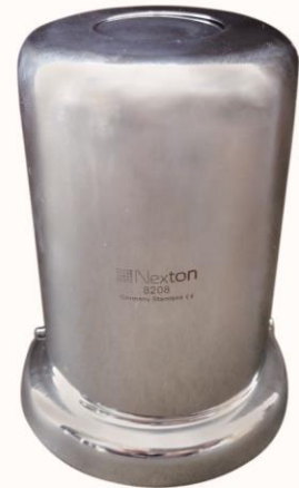
Cotton Holder S/S Polished No. Cat. 8208