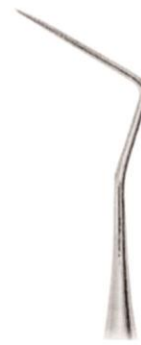
Explorer Fig.9 No. Cat. 1404